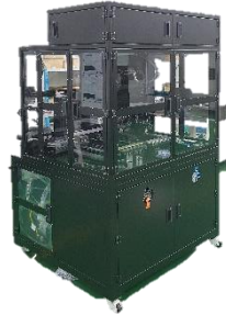
eJet - Valve Dispenser